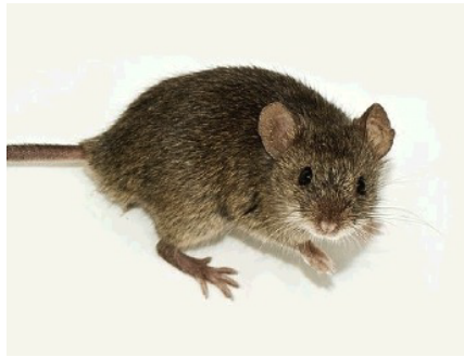
Figure 1: Picture of a mouse as presented in the instructions of the experiment.

unsuited for study. They were perfectly healthy, but keeping them alive would have been costly. It is standard to gas such mice. This is common practice in laboratories conducting animal experiments. Thus, as a consequence of our experiment, many mice that would otherwise all have died were saved. Subjects were informed about this default in a post-experimental debriefing. 5