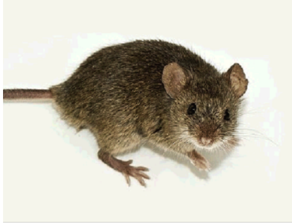
Figure 2: (Figure shown to subjects in the instructions.)

percentage points. The maximal likelihood (if all questions are answered correctly) is 46.8 percent. Hence, if you, for example, answer 30 questions correctly, the probability is 27 percent; for 0 correctly answered questions, it is 0 percent; for 15 correctly answered questions, it is 13.5 percent; for 40 correctly answered questions, it is 36 percent etc.